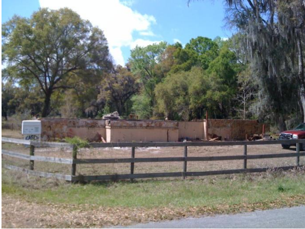
Going, Going, Going

interest expressed to the Marion County Dept. of Code Enforcement by this Board certainly helped keep things moving along. Sometimes local government gets it right (especially when taxpayers are bugging them on the phone!).