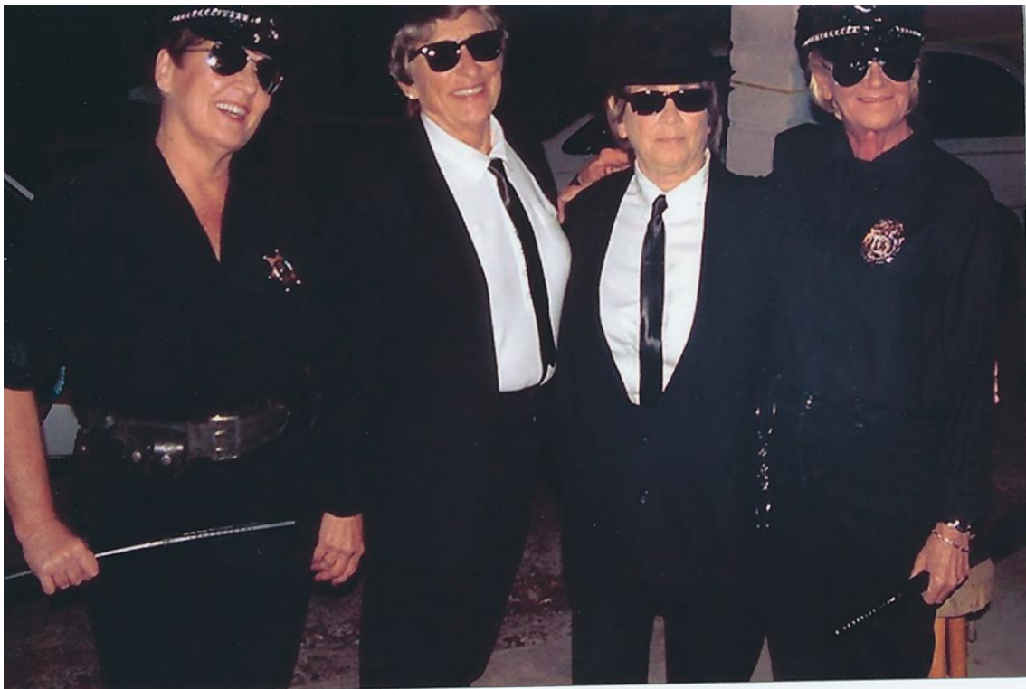
The Divas as the Blues Brothers

The lights were flashing and siren was sounding as the Police Car transporting the Divas arrived. The party goers were thinking – Oh no, the music is too loud and complaints have been lodged!