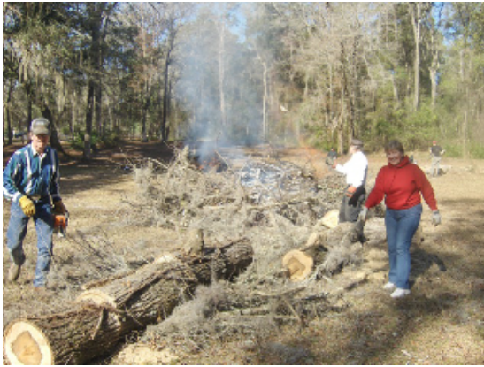
The Chainsaw Massacre Gang Just Had Way Too Much Fun...Power Tools, Fire, Tractors.....

These will show up much better in the newsletter published on our website.