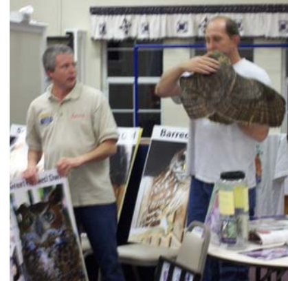
O.W.L.S. At The General Meeting