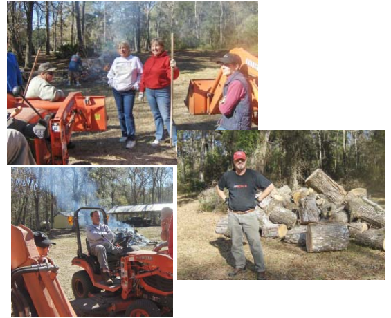
Some of the "Chainsaw Massacre Gang"