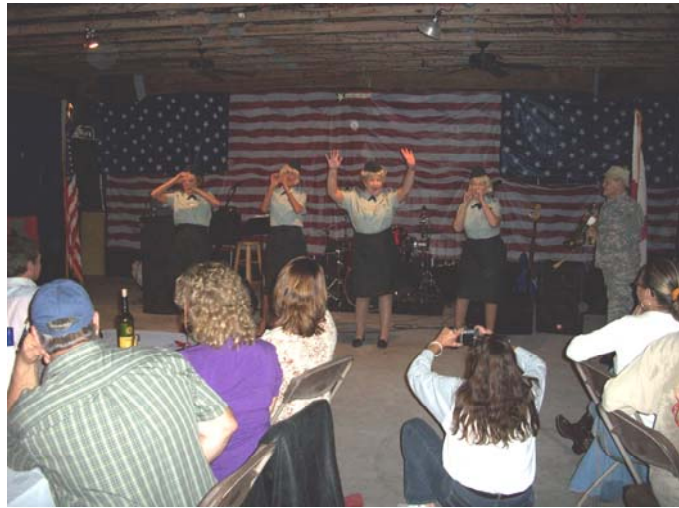
Divas & Artie Performing at Dancing Under the Stars