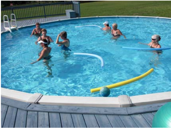
Summer Exercise Class

These will show up much better in the newsletter published on our website.