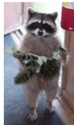
Anyone Lose A Cat?