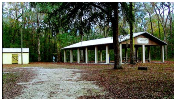
New Roofs on the Shed and Pavilion