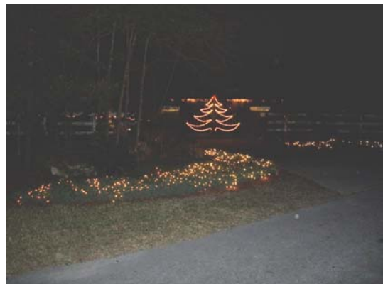
Christmas lights in MWF