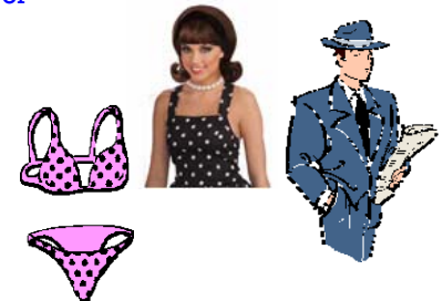
Duck Tail Hair

No patent leather before spring and white only after Memorial Day.