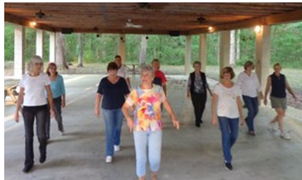
Are we having fun, yet?