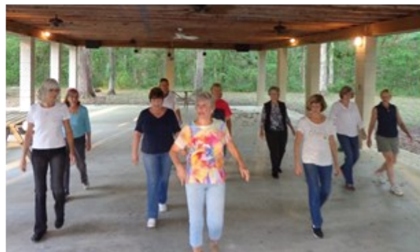
Are we having fun, yet?