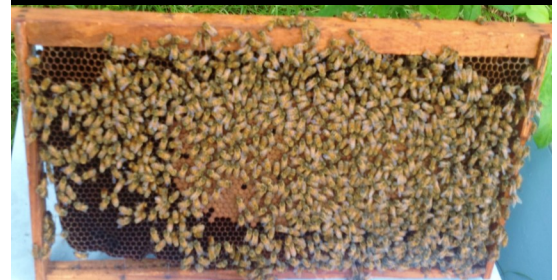
Vickie’s Honeybees on a honey frame