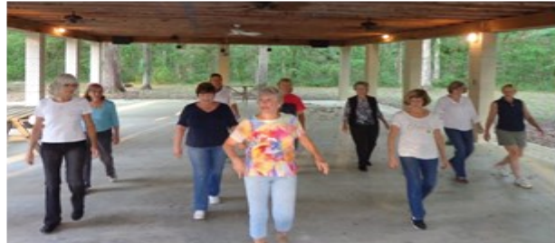
Are we having fun, yet?