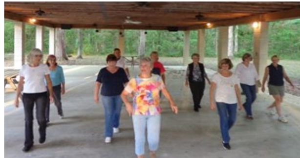
Are we having fun, yet?