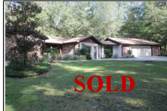
Wooded lot 1.6 acre on Lakewood Circle $24,900 Wooded lot 1 acre on Lake View Dr W. $17,500 SOLD