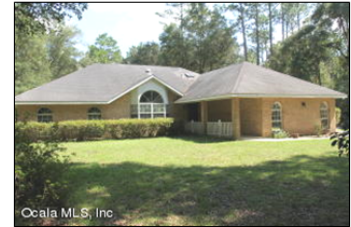
Ocala MLS, Inc 4 Bedroom, 3 Bath, 3150 SF 2 plus acres $265,000 in MWF

Desirable Meadow Wood Farms— Let me help you find your dream home in this friendly horse community where your neighbors know you by name!