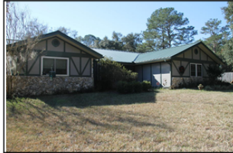
MWF-quiet street, 3/2/2, 3 Acres 3 stall barn.