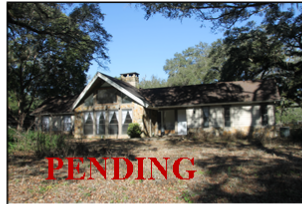
Wooded lot 1.6 acre on Lakewood Circle $24,900 2.6 Acres partially cleared Needles Dr $59,000

MWF 5 Acres 3 BR 2 Bath 2 Stall Barn Cottage RV Shed Pool