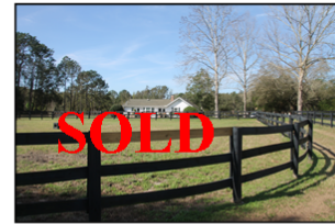
MWF-5 Acres 3 stall barn 3 BR, 2 Bath Many updates

MWF 5 Acres 3 BR 2 Bath 2 Stall Barn Cottage RV Shed Pool