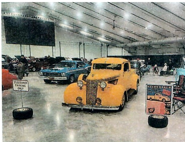
Jeff Rice – 1937 Studebaker J5 Coupe Express